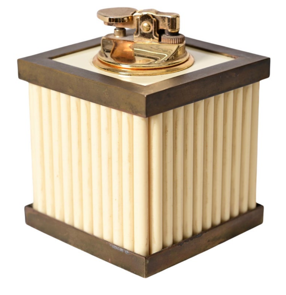
TOMMASO BARBI LUCITE AND BRASS TABLE LIGHTER, 1970, OFFERED BY ITALIAN DESIGN 900 SRLS

"Another gift idea — perfect for lighting dinner candles"