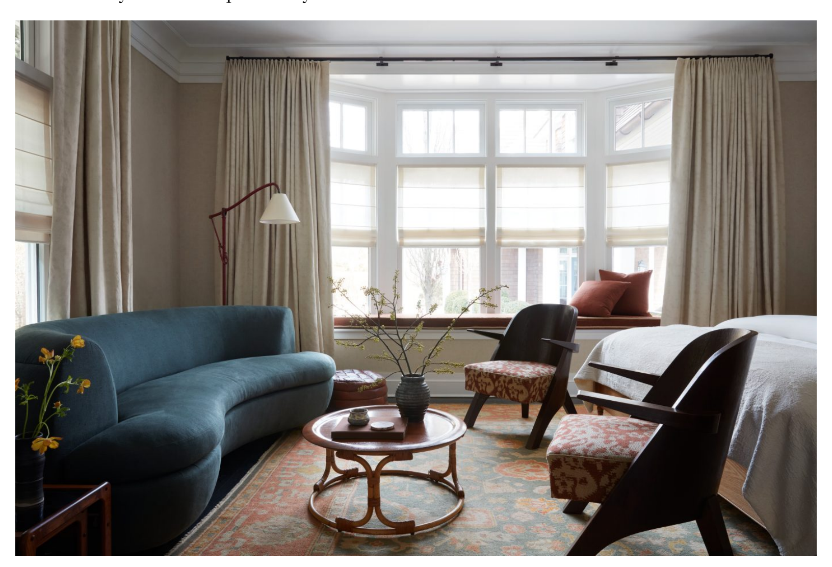
A ground-floor guest bedroom has its own seating area, thanks to a pair of armchairs and a Decca sofa by Dmitriy & Co.

sourced from 1stDibs, that are at once practical and elegant, as is a set of burnished-brass bar stools by Chelsea Upholstery.