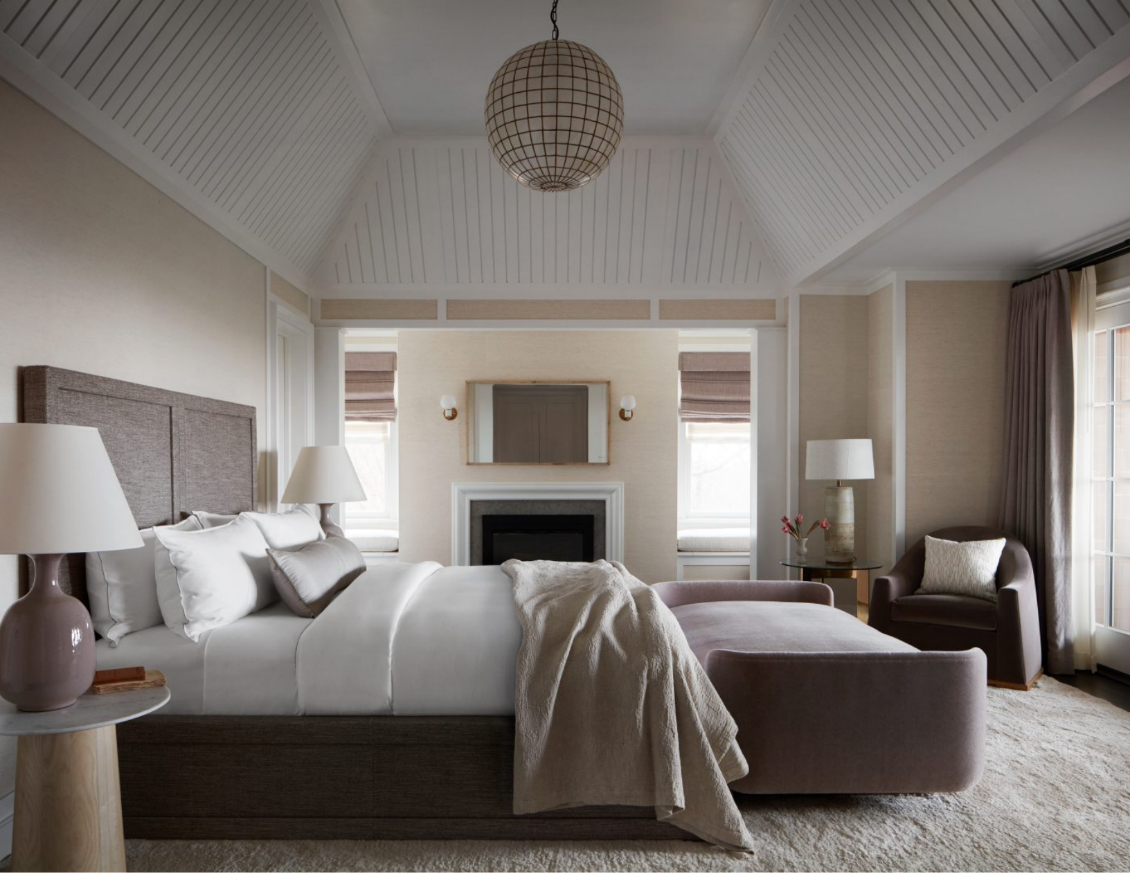
The primary bedroom is a study <u>IN ELEGANT NEUTRALS</u>, like linen wallpaper from Studio Zen and a subtly textured bed frame by Dmitriy & Co., which also made the plush ottoman and armchair, as well as the bedside lamp that rests on a Stahl + Band table. The ceiling fixture is by RH, and the rug is from Woven.

Upstairs, the primary bedroom offers a master class in . "We deliberately kept things soft here and added texture with sumptuous fabrics and tactile linen wallpaper," says Charles. "The room opens up to an incredible view of the water." Next to the bedroom is a relaxed office space complete with custom pull-out bed and chairs, as well as a coffee table and a side table/magazine rack, both from Orange at 1stDibs. Bedrooms belonging to the children and for guests demonstrate a similar low-key approach, some decorated with pretty floral wallpapers and others with elegant stripes.