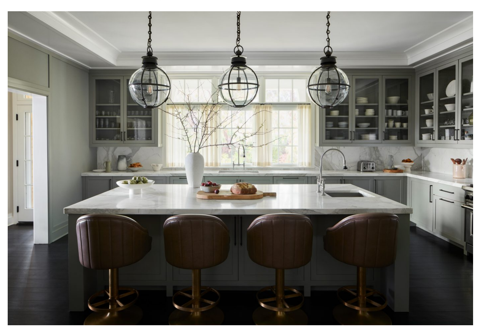
An expansive island and burnished-brass and leather stools by Chelsea Upholstery make the kitchen a family hub. The trio of lanterns is by via 1stDibs. The cabinets were repainted in Pigeon by Farrow & Ball, and existing countertops and back splashes were replaced with Calacatta Borghini marble.

Continuing the dining room's theme of warm colors, a pair of shapely cocktail chairs by GEORGE SMITH sits in the window. Blue leather chairs from Rupert Bevan surround a generous dining table by Matthew Cox. Lighting comes courtesy of a row of hanging pendants by Los Angeles-based glass artist Alison Berger and a chic table lamp from PRB on 1stDibs. Also adjacent to the living space, a paneled bar room is painted in Studio Green by Farrow & Ball, creating a snug but sophisticated feel. Above the table hangs a MODERN DANISH CHANDELIER, sourced from Morentz on 1stDibs.