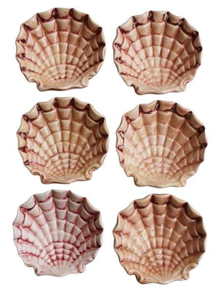
SET OF 6 HOLLYWOOD REGENCY MINI CERAMIC SEA SHELL BOWLS, 20TH CENTURY, OFFERED BY SCOUT STUDIOS

"These are my dream dessert bowls. Shouldn't you always have something with a sense of humor on the table?"