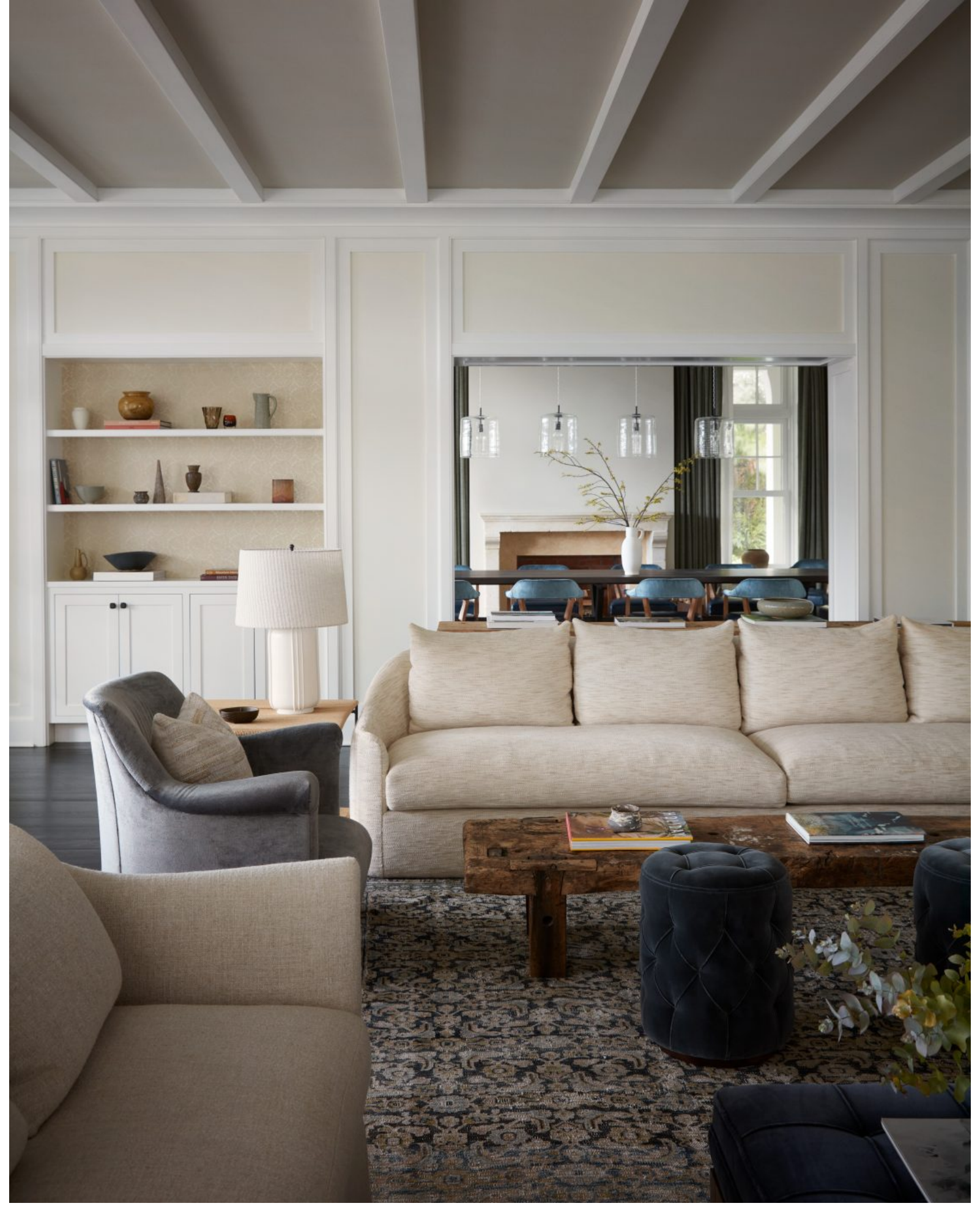
Another view of the living area provides a glimpse of the dining room beyond. The built-in shelves (left) were already in place, says Charles, who added visual interest by papering the niches. Rustic tables from were 1stDibs finds.